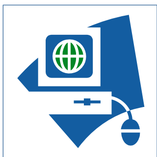
Online Registration-as easy as 123!